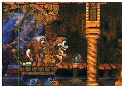
NEW TOYS Crystal balls, Grendel scarers, and other new gadgets abound in this add-on.

If you've grown weary of traditional Norms and their offspring, the kit offers several new Norm varieties. In addition to a particularly evil-looking "Santa," you'll find three other types that should offer a bit of genetic variety to potential offspring.